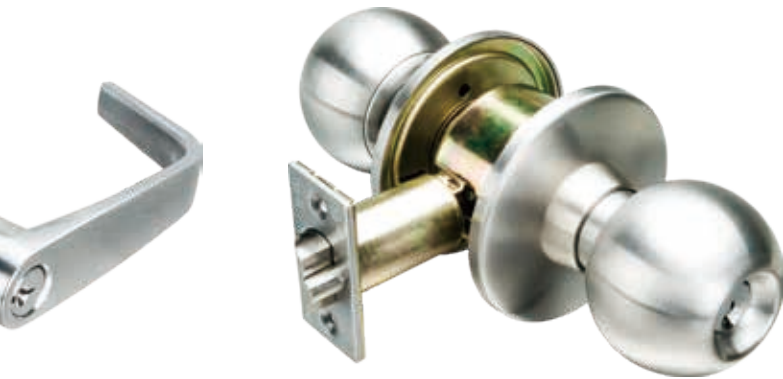
LH Series ANSI Grade 1 Extra Heavy Duty