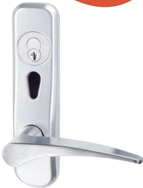
iF-94 Mortise Locks