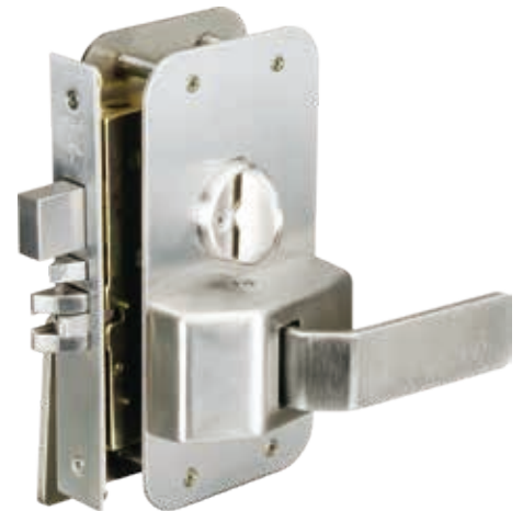
For Mortise Locks

In certain applications, such as hospital rooms, turning doors may become an obstacle when making an ingress or egress. I-TEK has developed a paddle-shaped handle designed in such a way to eliminate the need for holding on the door handle, which allows medical personnel to open doors in a fast and convenient way. Simply push or pull with any part of your body and see how easy it is to open a door without your hands.