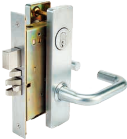
ME Escutcheon Design MS Sectional Design available