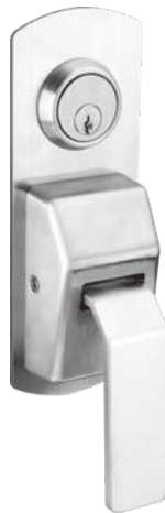
For Exit Devices