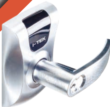
iF-01 Cylindrical Locks