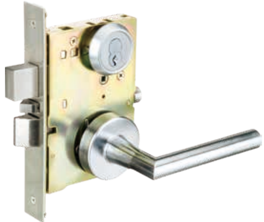
MS Sectional Design ME Escutcheon Design available