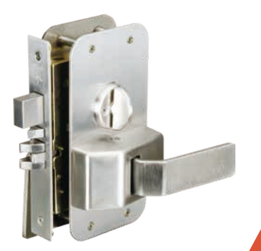
For Mortise Locks

In certain applications, such as hospital rooms, turning doors may become an obstacle when making an ingress or egress. I-TEK has developed a paddle-shaped handle designed in such a way to eliminate the need for holding on the door handle, which allows medical personnel to open doors in a fast and convenient way. Simply push or pull with any part of your body and see how easy it is to open a door without your hands.